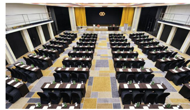
Sofitel Victoria Hotel Conference Room