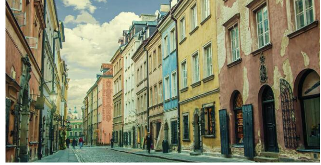
Warsaw Old Town