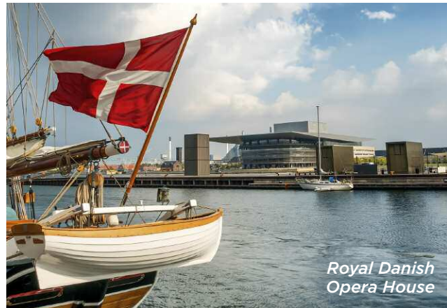
Royal Danish Opera House