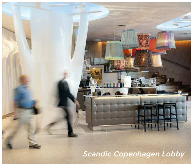
Scandic Copenhagen Lobby

and enjoy unlimited travel around Copenhagen using the following link: