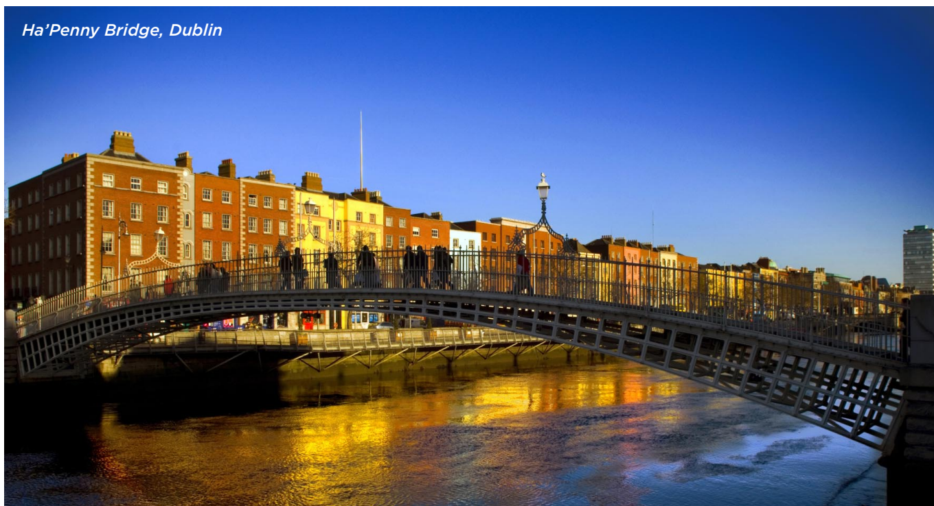
Ha'Penny Bridge, Dublin