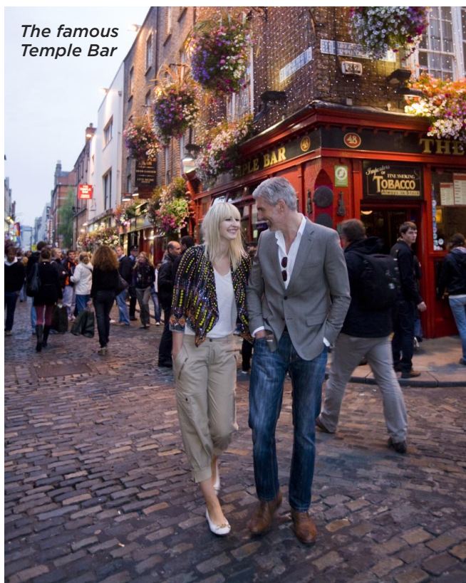
The famous Temple Bar

Co-chairs of the 2022 Dublin Congress Technical Committee