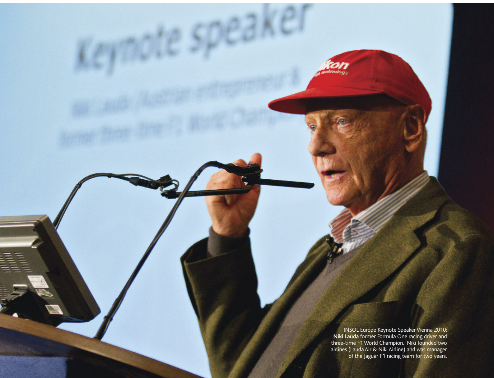
INSOL Europe Keynote Speaker Vienna 2010; Niki Lauda former Formula One racing driver and three-time F1 World Champion. Niki founded two airlines (Lauda Air & Niki Airline) and was manager of the Jaguar F1 racing team for two years.